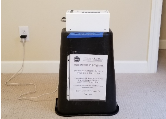
Test site - example