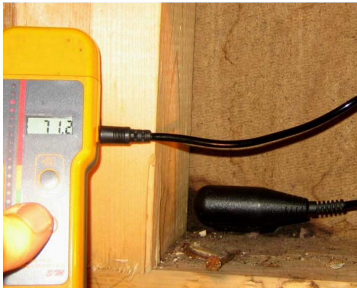
Photo - Moisture reading below dining room window