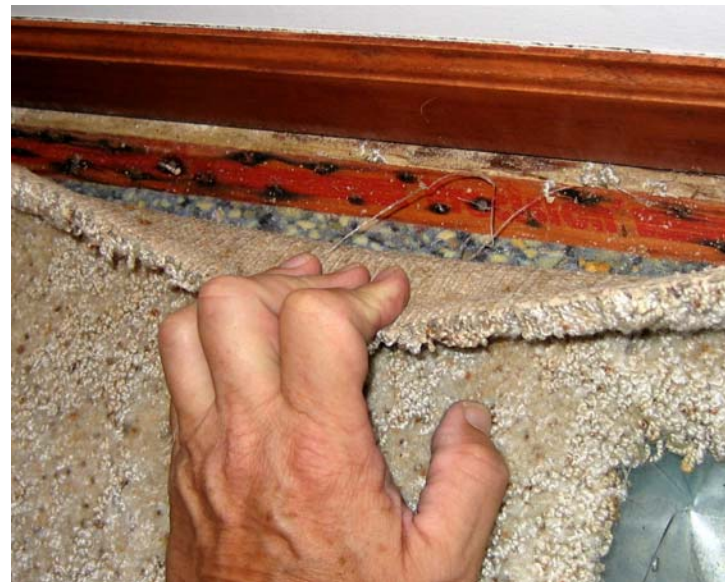
Photo - Study carpet tack strip