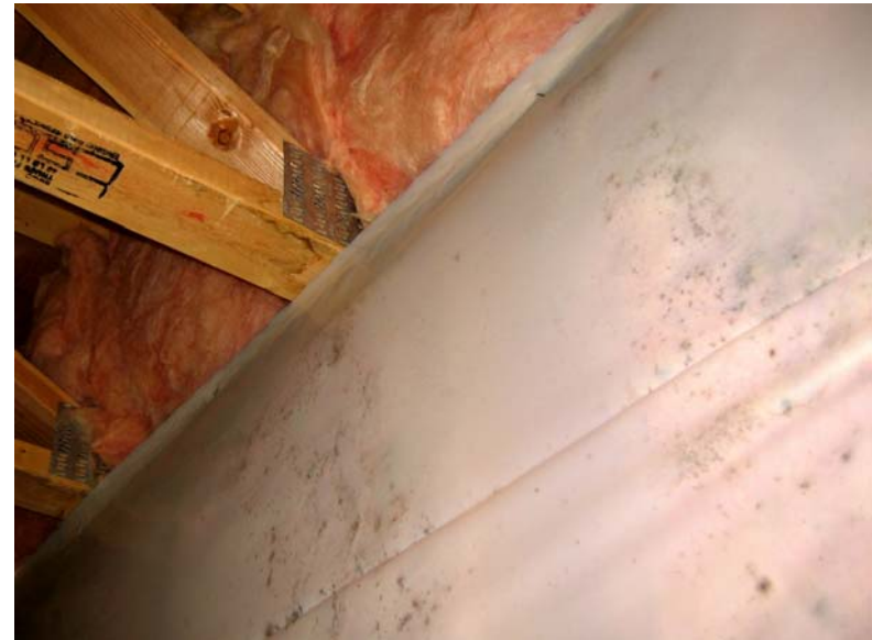
Photo - Rear wall plastic sheeting