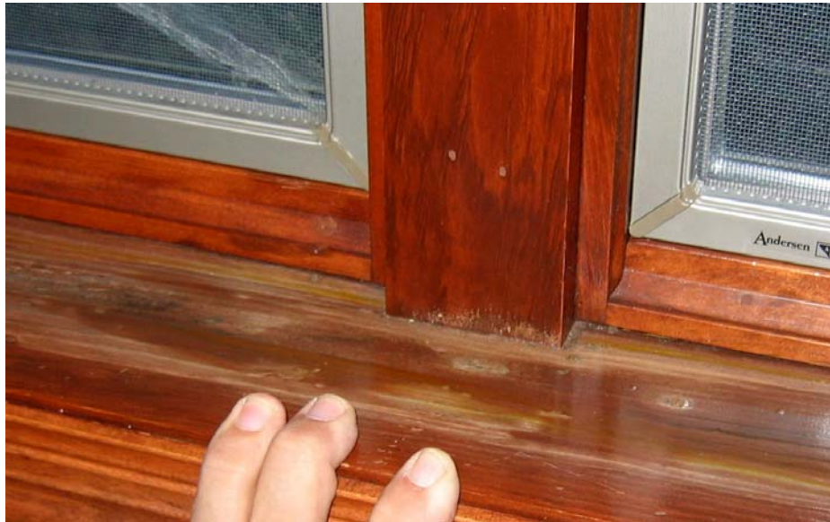
Photo - Window in study - office