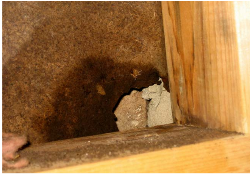
Photo - Hole in sheathing below dining room window.