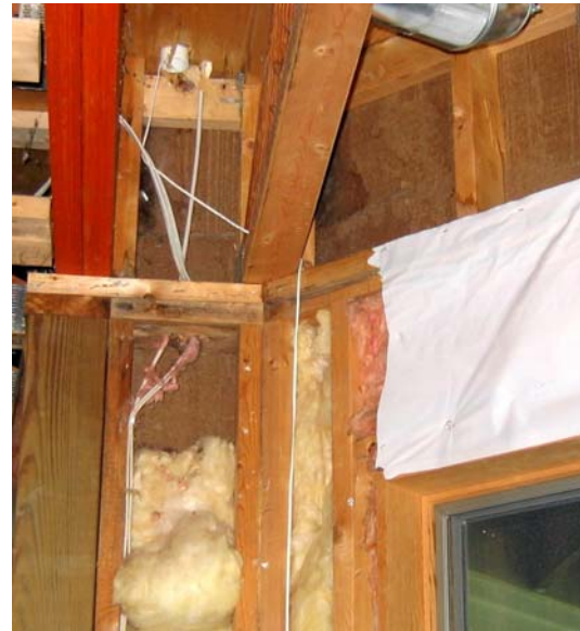
Photo - Rear wall water entry locations