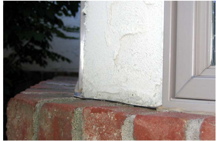
Photo - Dining room corner, caulk and flashing